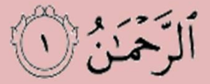
Sura Ar-Rahman, 55:1